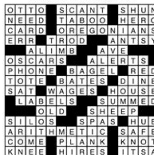
©2015 Tribune Content Agency, LLC All Rights Reserved. 3/23/15